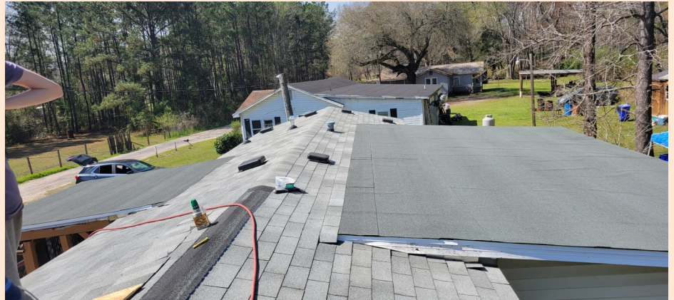
Roof Work from Rural Missions trip to Hollywood SC